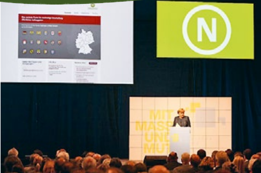
Federal Chancellor Merkel activating the website in Berlin on 13 May 2013