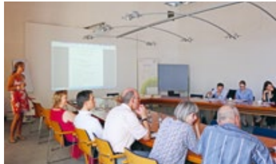
KNB training at the Baden-Württemberg State Ministry for the Environment, Climate Protection and Energy

This module presents the legal framework for sustainable procurement, starting with current laws and regulations and extending to the implementation of the new EU directive.