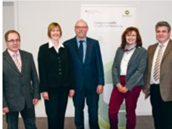
The KNB team

The Project Group on Sustainable Procurement at the Federal Ministry of the Interior was active from August 2012 to September 2013 to coordinate among the federal ministries and the state governments and to plan the KNB. After the web-based information platform went live and contact with the federal ministries and state governments had been established, the work of the project group was done. So the project group was dissolved and the KNB took over.